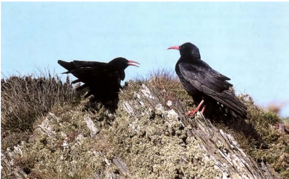
B. R. Hughes/Windrush

(2) singing male on 28th June. HIGHLAND Three localities: (1) pair on 9th May in suitable habitat; (2) two singing males; (3) singing male.