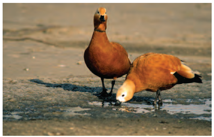
69. The Ruddy Shelduck Tadorna ferruginea has become established as a breeding bird in neighbouring countries in Europe such as Denmark, Germany and the Netherlands. These populations are of naturalised birds, which probably originate from wildfowl collections. Some of the Ruddy Shelducks recorded in Britain may be from these breeding populations, or from the few pairs that have bred in Britain.

In 2009, two pairs were reported from three sites in Wiltshire, including a pair resident from March to August, but there was no evidence of a breeding attempt. However, a pair bred in that county in both 2010 and 2011, at the same site, using a nestbox provided for owls or Common