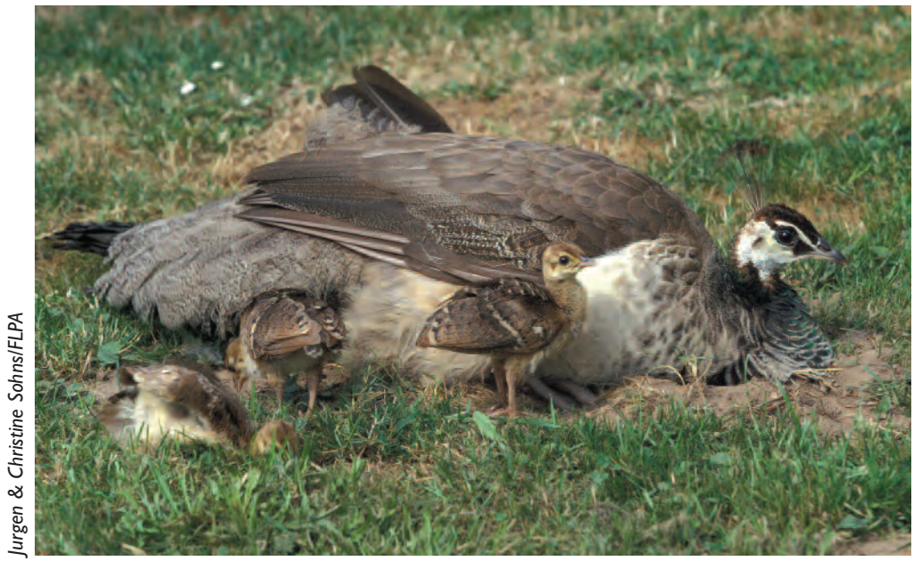
68. The male Indian Peafowl Pavo cristatus is a familiar sight around stately homes and ornamental gardens, but the less gaudy female is not as conspicuous. Breeding birds can be easily overlooked unless an incubating female is flushed by chance, or young birds are seen accompanying the female, as shown here in Germany in 2001.